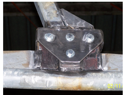
Stem/Bail connection after mod.