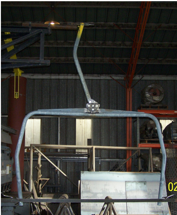
Riblet hanger during conversion process.