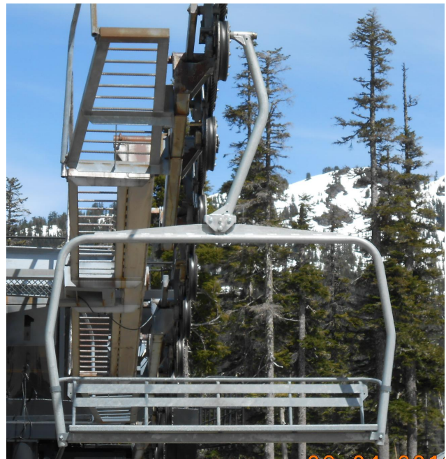
A1871 Quad Hanger Installed at Mt Baker Lift #8