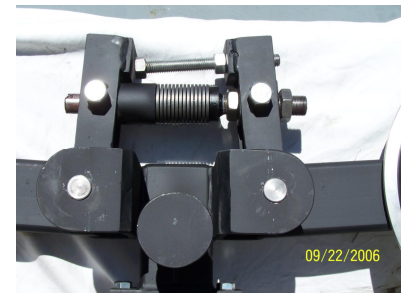
Spring Pack Assembly