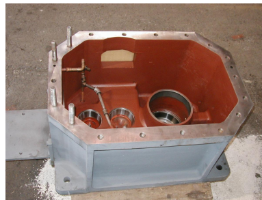
Cleaned out and cups installed.