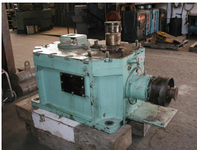
Reducer before rebuild.