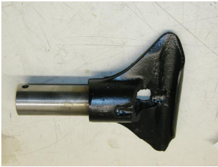
Heron-Poma grips 1-1/8" rope #B-1437 1-3/8" rope #B-1410