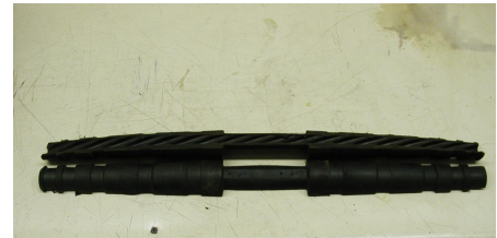
Heron Cable Sleeves All sizes