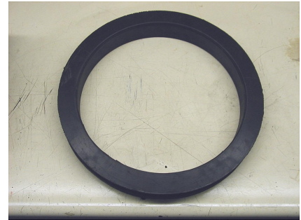
Heron / Heron Poma Sheave Tires-Conductive and Non Conductive Bull-wheel Liners