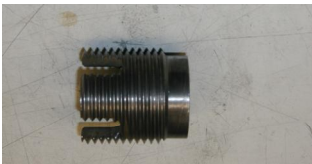
Grip Nut #D-871