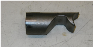
Grip Jaws 1-1/8" rope #D-983 1-3/8" rope #D-865